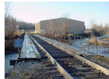
Existing bridge timber open deck top.