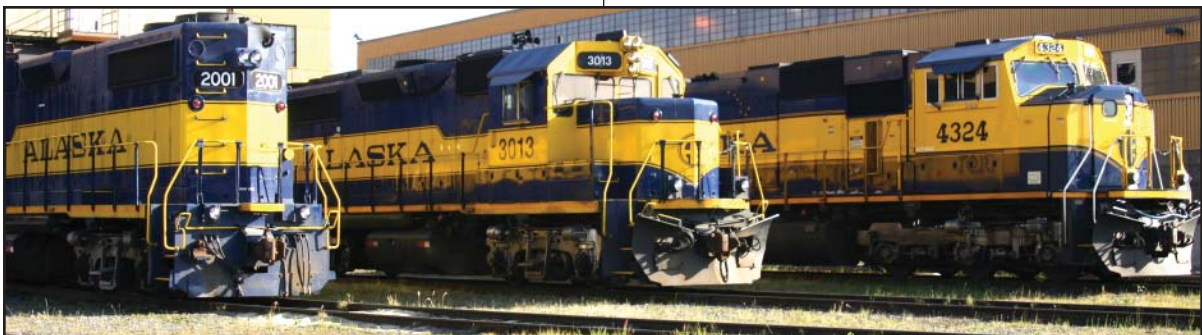
Left to Right: GP-38 locomotive (No. 2001), GP 40-2 locomotive (No. 3013) and SD70MAC locomotive (No. 4324).