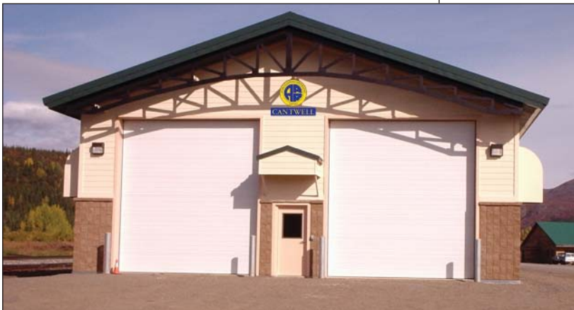
The first Section Maintenance Facility was completed in Cantwell in 2006.