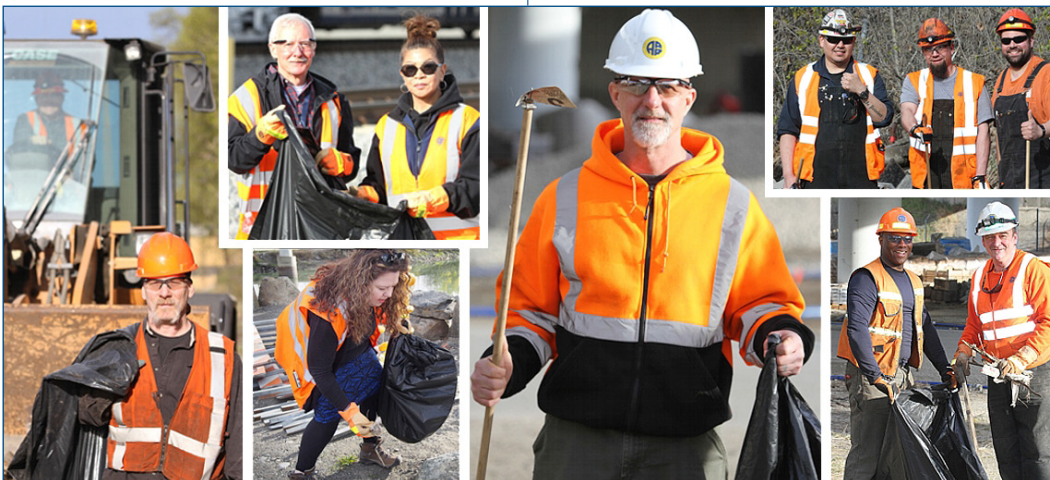
Railroaders team up to pick up trash and debris on Alaska Railroad property during a previous clean-up day effort.