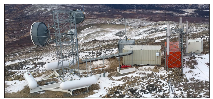
A new communication site is completed on Bald Mountain in 2016.