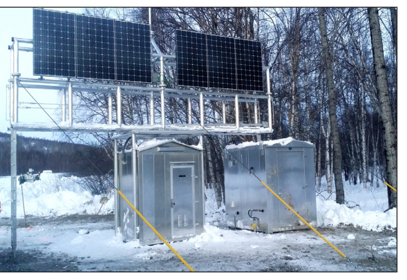
Wayside equipment at Curry is housed in new shelters and powered by solar energy generation and solid oxide fuel cell technology.

In 2008, Congress mandated PTC for the nation's largest railroads and for railroads that carry passengers. Failure to meet the mandate will eliminate ARRC's passenger train operations. The federally-mandated deadline to complete PTC