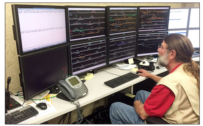
Office segment control and monitoring is tested in the PTC Lab.

and federal and state grants. Since 2014, ARRC has relied more heavily on state funding due to dramatic declines in both business revenue and federal grants. With the State facing its own budget woes in 2015, the railroad gained legislative approval to issue $37 million in tax-exempt revenue bonds. Project cost is estimated to total $171 million.