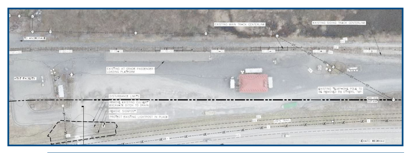
Portage station improvements north end.