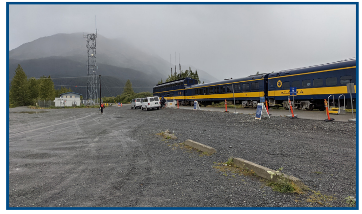
The existing passenger platform will be relocated south and expanded. Limited gravel parking areas will be expanded, paved and striped.