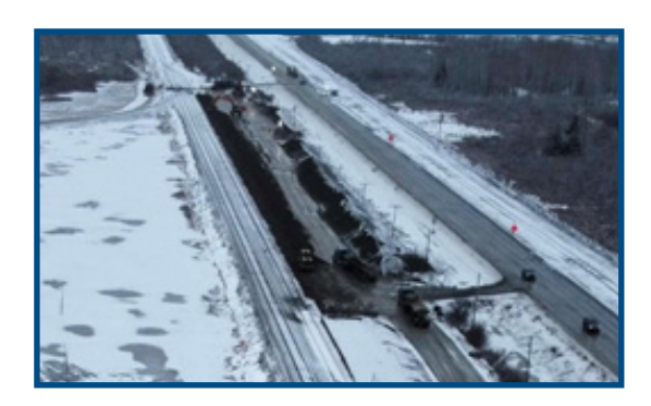
Arial view of MP 64 at Portage with improvements underway.