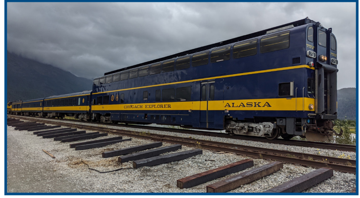
The Portage Siding will be upgraded into an interlaced (gauntlet) siding to accommodate a full-level passenger platform.

In recent years, ARRC and USFS have been collaborating on concept development and preliminary engineering, while coordinating with ADOT&PF to avoid conflicts with nearby highway projects. Preliminary engineering, environmental work and documentation, and construction traffic