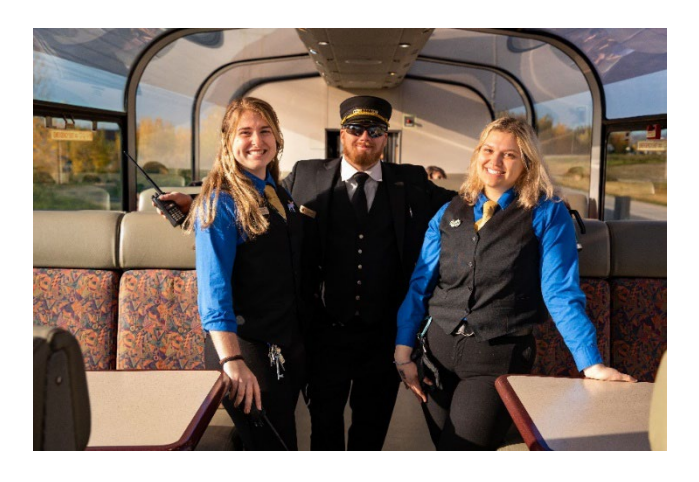
Alaska Railroad employees welcome guests to the 'Railroad Days' Open House in Fairbanks on Sept. 23, 2023.

The Alaska Railroad is state-owned corporation providing year-round inter-city public rail transportation and freight service from Seward to Anchorage to Fairbanks. More information about passenger service schedules, fares and depot locations is available at https://www.alaskarailroad.com/.