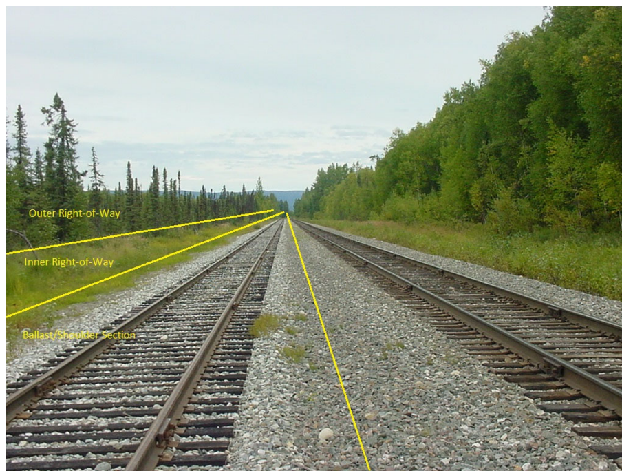
Figure 1: ARRC Vegetation Management Zones