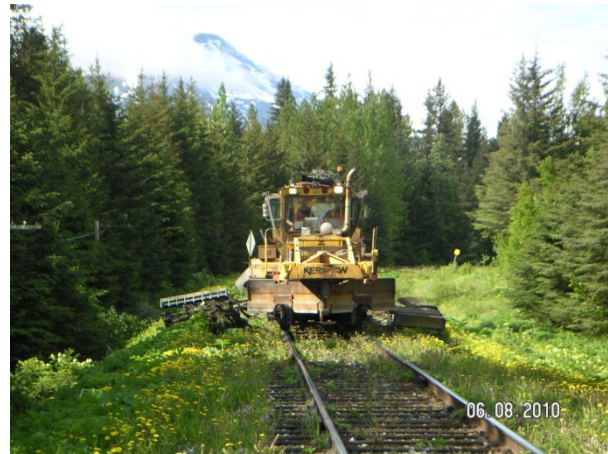
Mechanical methods on ARRC Main Track have plowed seeds and roots into ARRC ballast and shoulder section.

Ballast/Shoulder Zone: To meet the stated purpose of the IVMP, this zone must be practically free of vegetation. The ARRC has not had the ability to effectively control vegetation on much of its right-of-way for many years, the zone has endemic vegetation. Mechanical methods have entrained much of the ballast shoulder section with roots and seeds. See photo. Due to the factors noted above, the areas of this zone will be treated annually with a pre-emergent herbicide while utilizing the Recospray technology.