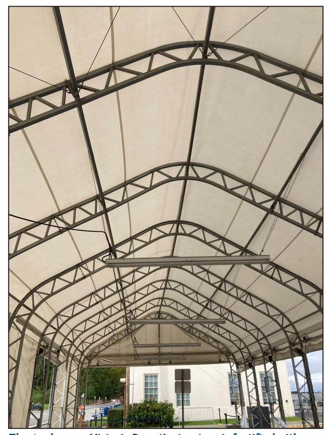
The Anchorage Historic Depot's structure is fortified with a sturdy frame. The depot's baggage shelter cover is reaching the end of its useful life and must be replaced.

For more project information, email the Alaska Railroad at <u>Public</u> <u> Comment@akrr.com </u>.