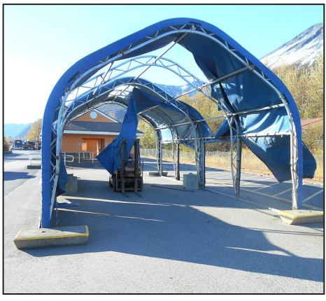
The existing Seward Depot baggage shelter.

In Anchorage, the replacement cover for the Anchorage Baggage Shelter will be approximately 30 feet wide by 70 feet long. The cover will be made from material (and color) similar to the existing shelter material.