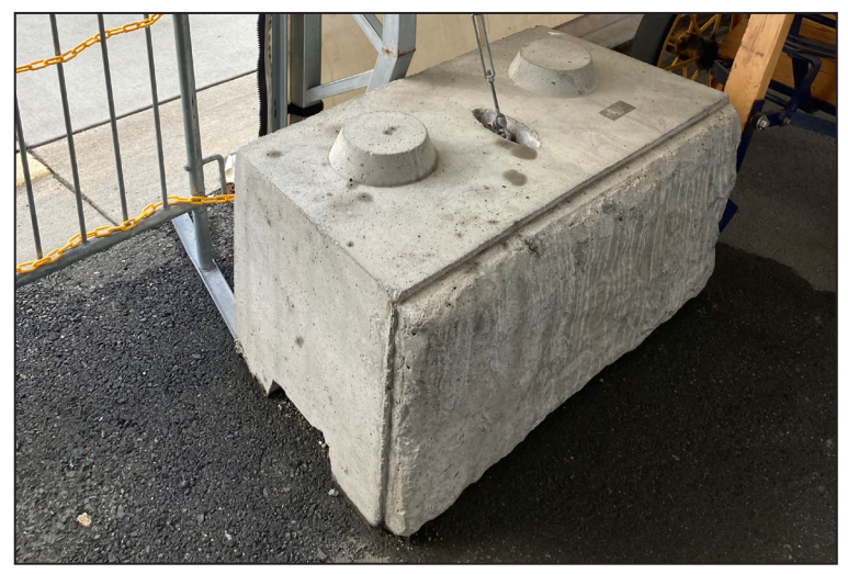
Concrete tie-down blocks anchor the Anchorage depot baggage shelter.