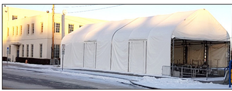
The project calls for a baggage shelter in Seward to be similar to the Anchorage Historic Depot's structure (pictured).

Replacing the worn Anchorage Historic Depot baggage shelter cover maintains the same benefits for rail travelers transiting in and out of Anchorage.