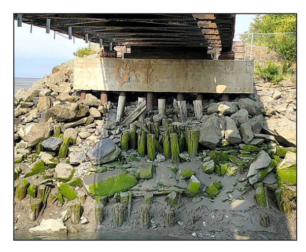
Top Left: A cross section of the proposed 125-foot through-plate girder bridge placed on the existing substructures. Top Right: An existing abutment.