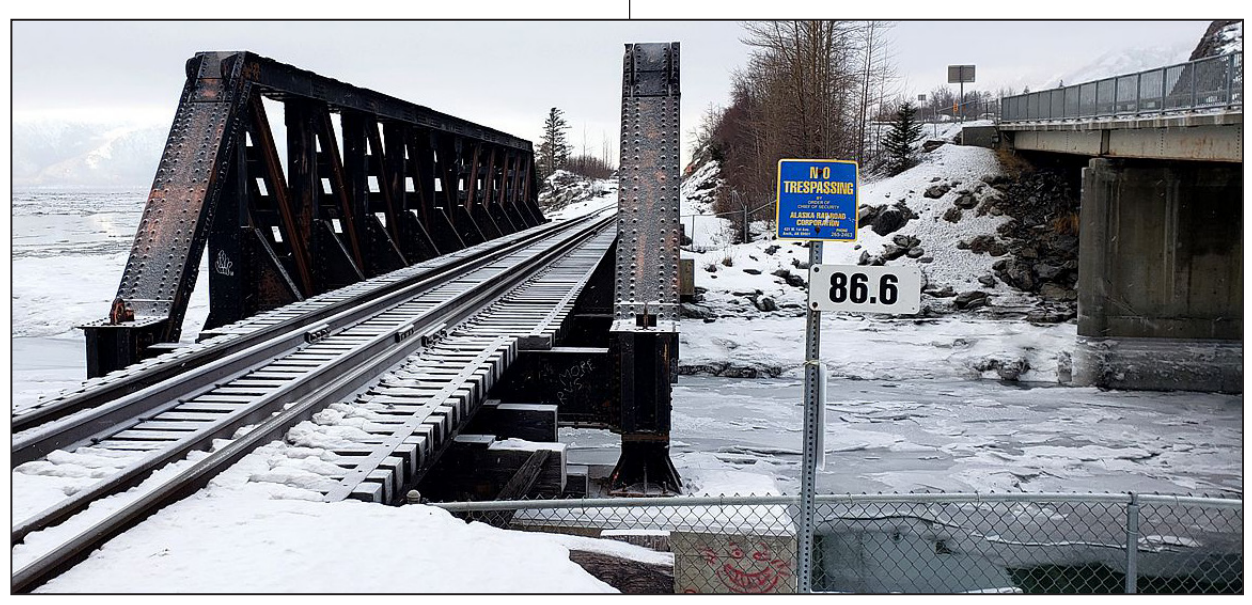
Bridge 86.6 crosses Bird Creek, just south of Anchorage.

The grant is half (50%) funded by the FRA and 50% by the Alaska Railroad to satisfy the matching contribution required by CRISI grants.