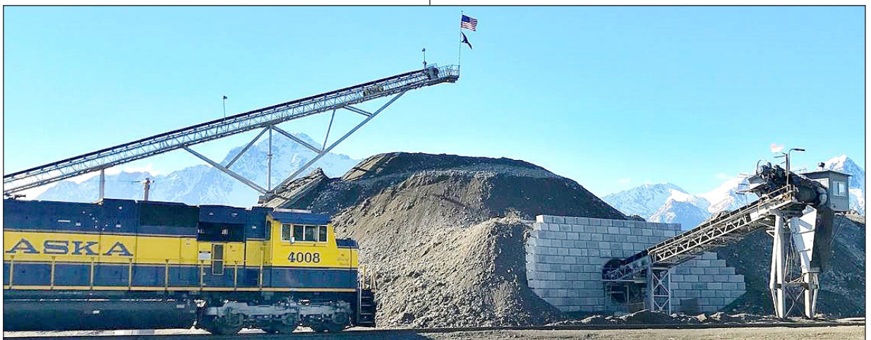
A gravel train loads at the tippel of AS&G's gravel mine in Palmer.