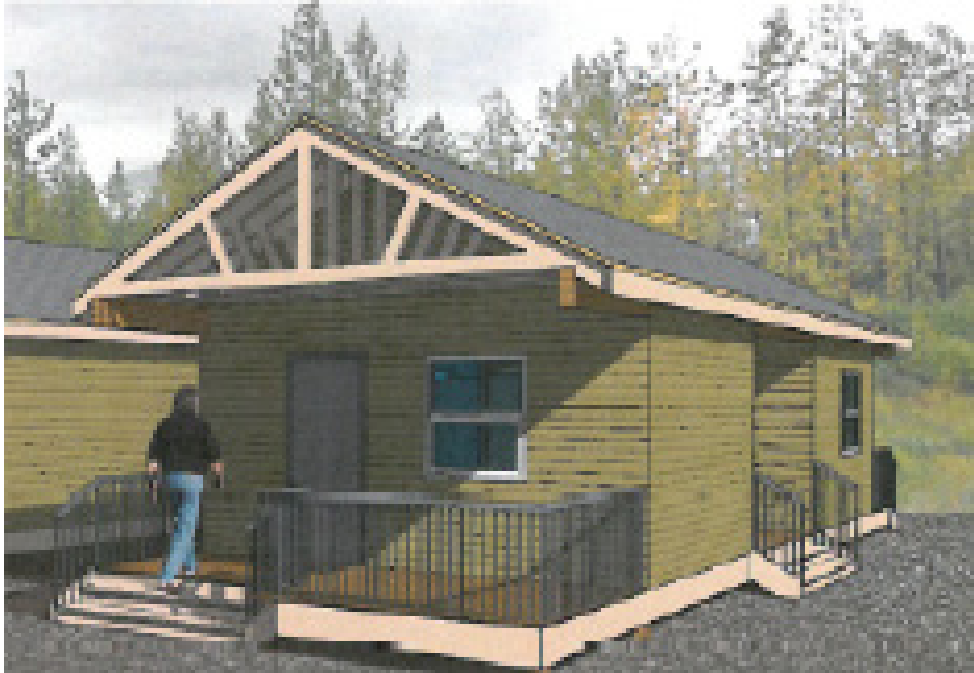
(Concept design for housing)