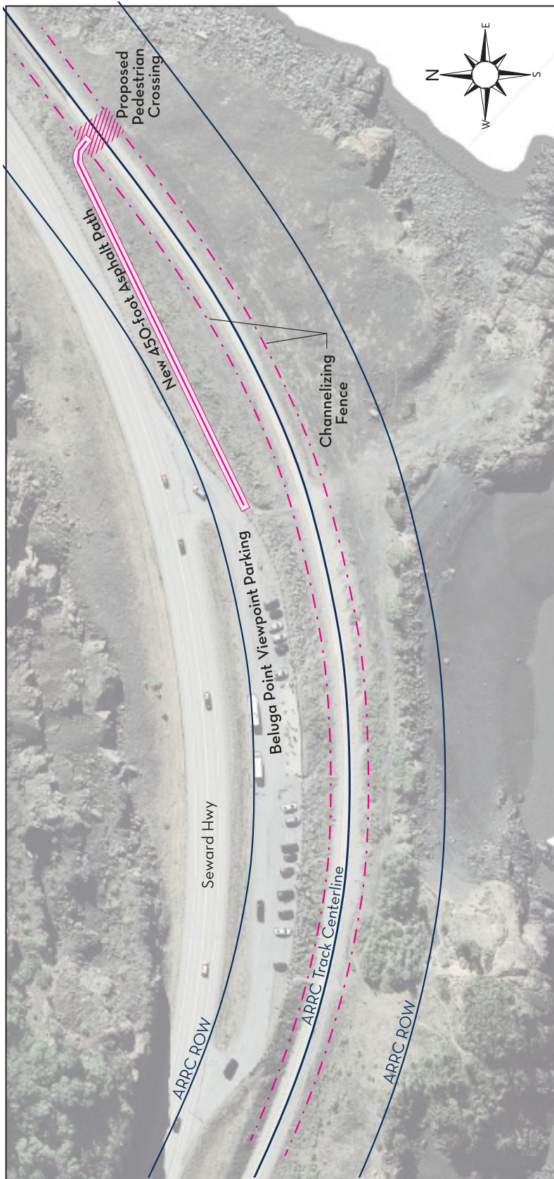
A preliminary concept and site plan for the short term solution involves fencing to channel pedestrians to a single track crossing point with better visibility.