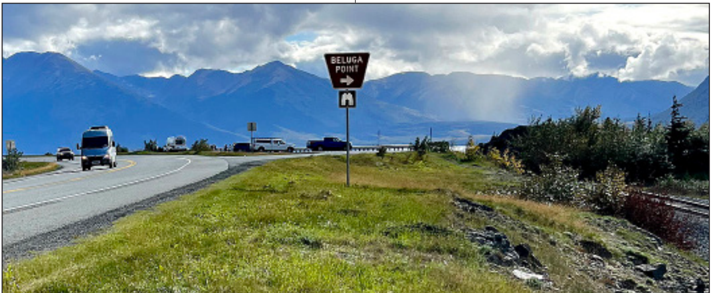
Identified as a wildlife viewing area, Beluga Point features a parking lot and interpretive signs situated between the Seward Highway and the Alaska Railroad tracks.

For more project information or to provide comments, email the Alaska Railroad at Public_Comment@akrr.com .