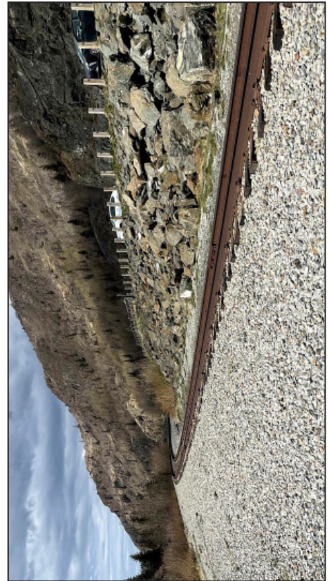
From Beluga Point, looking west, the track presents a blind curve for both pedestrians and trains.