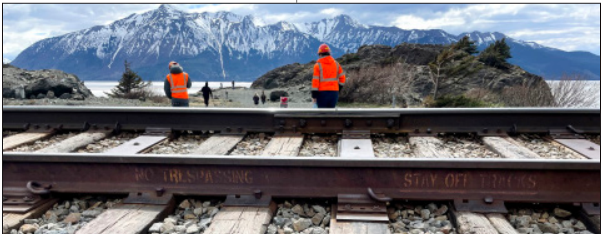
Beluga Point along Turnagain Arm is a popular spot, annually attracting thousands of residents and visitors who frequently cross the railroad tracks to access the waterfront.