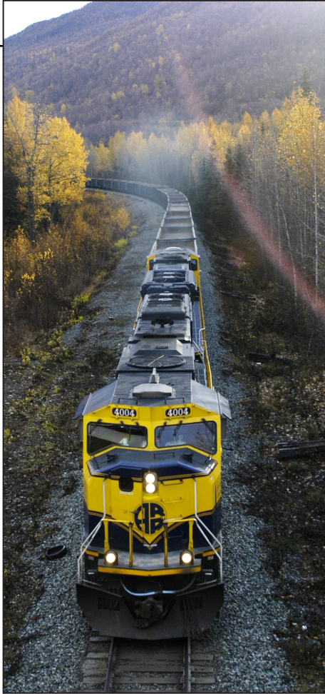
A gravel train travels from Mat-Su to Anchorage early fall.