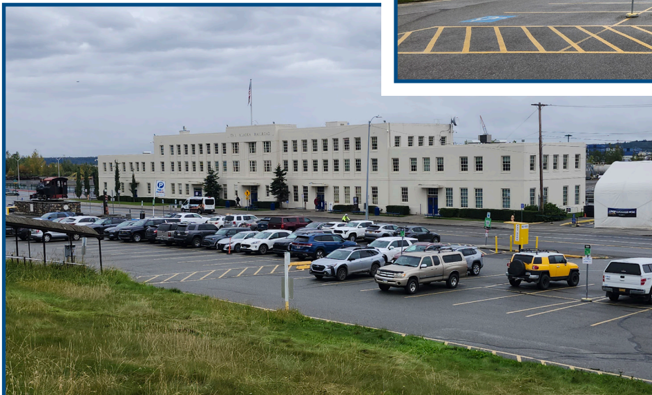
The Anchorage Historic Depot parking lot located in Anchorage, Alaska.