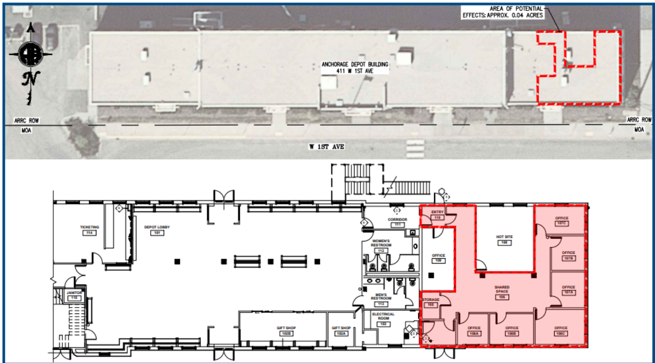
Site being remodeled.