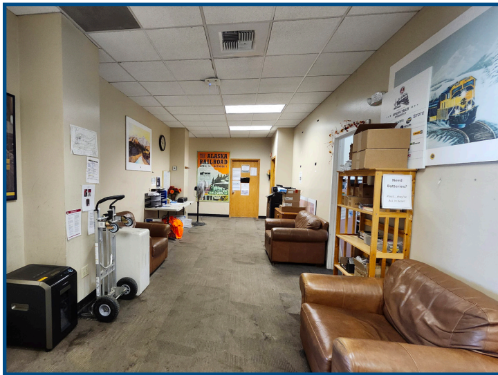
Passenger operations area at the Anchorage Depot.