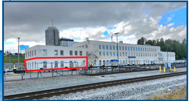
Depot area being remodeled.