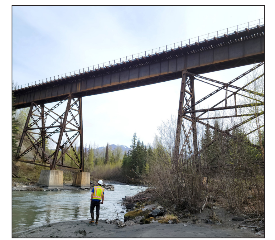
Bridge 127.5 crosses Eagle River north of Anchorage.