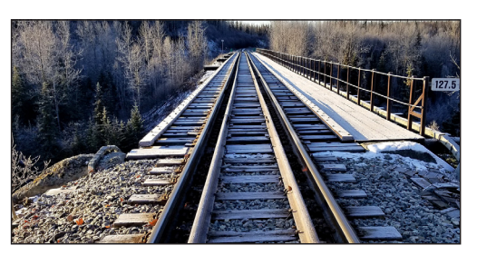
View of top of the bridge at Milepost 127.5, looking south.

The project cost estimate is $31.6 million funded 80% by the Federal Transit Administration, with the 20% required match funded by the Alaska Railroad.