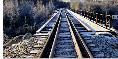
View of top of the bridge at Milepost 127.5, looking south.

The project cost estimate is $43.3 million funded 80% by the Federal Transit Administration, with the 20% required match funded by the Alaska Railroad.