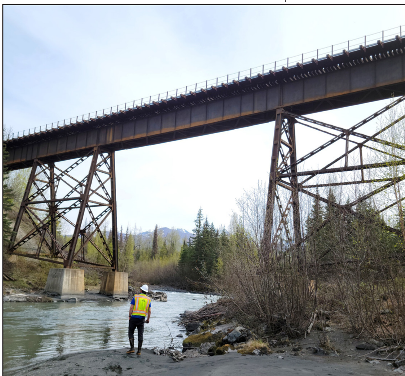
Bridge 127.5 crosses Eagle River north of Anchorage.