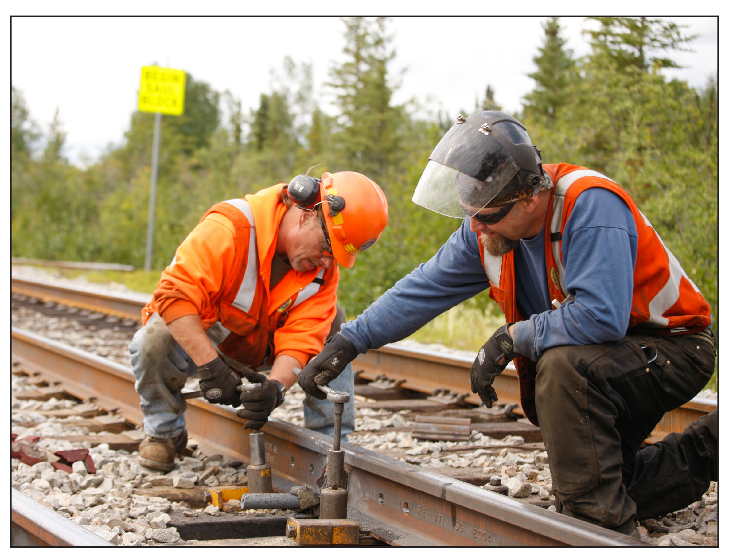
Controlled vegetation helps to minimize trip, slip and fall hazards to employees who work along the track.