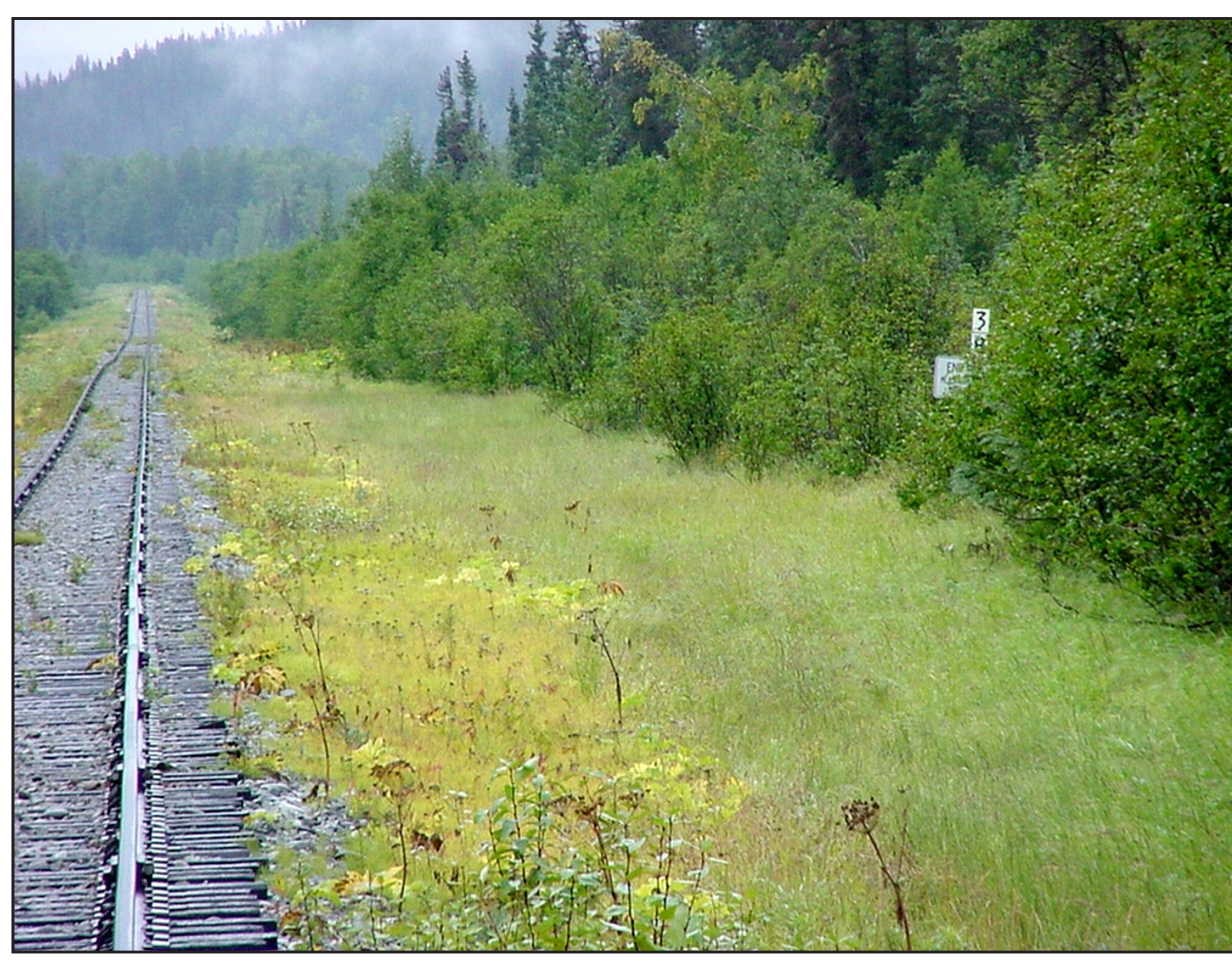
Obscured signs and infrastructure pose safety concerns.