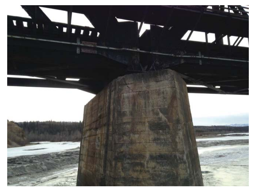
Bridge MP 370.7, Pier #3