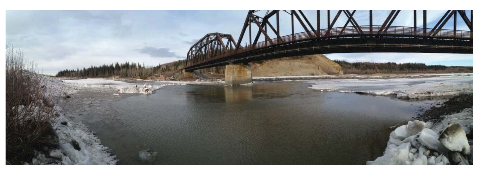
Looking north at the brige MP 370.7 over the Nenana River.