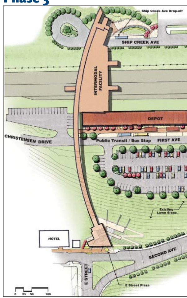
Phase 3 includes an elevated walkway and departure lounge.