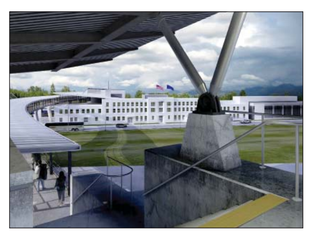
Architect's elevated walkway rendering.