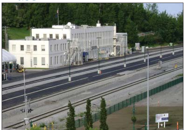
Phase 1 added tracks and a passenger platform.

train operations and general public access areas. Fencing was installed between North C Street and Cordova along the parking lot across the street from the Comfort Inn (see map below).