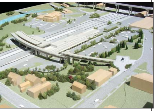
ECI/Hyer architectural design model view from the south.