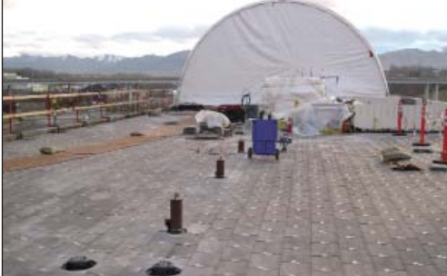
Right: A tent covers the roof area where old utility equipment is removed. Above: A new paved-system roof is installed along with more insulation for energy conservation.