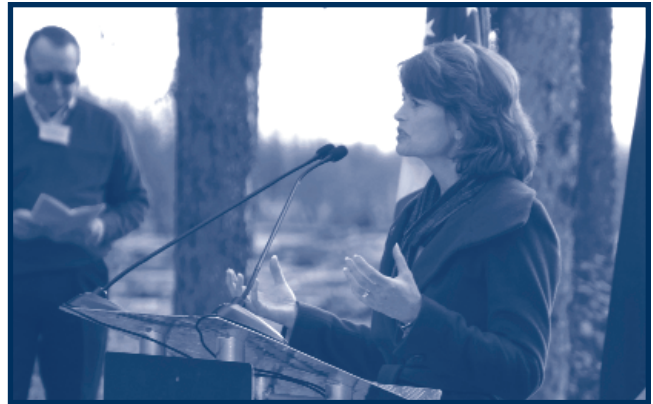
U.S. Senator Lisa Murkowski adds her remarks in support of the Northern Rail Extension projects.