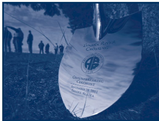
(see "Bridge Groundbreaking" on page 3)

A 21-shovel salute concluded a groundbreaking ceremony September 28 at the Tanana River bridge construction staging site near Salcha. More than 125 people attended the dignitary-peppered event to celebrate the start of the long-anticipated Northern Rail Extension, which is expected to boost local and state economies with millions of dollars spent on local equipment, materials, supplies, lodging and labor.