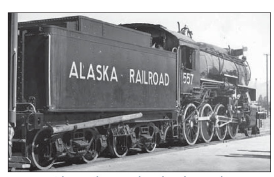
No. 557 with a tender car.