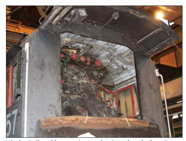
Alaska Railroad locomotive mechanics take a look under the hood shortly after the No. 557 is transported to the Anchorage Yard, where it once again its wheels were set onto Alaska Railroad tracks mid-January 2012.

But first, the locomotive must be restored. In June, the non-profit Engine 557 Restoration Company was formed to raise funds for, and to coordinate and oversee, the locomotive's rehabilitation. The goal is to re-establish the 557's full classic appearance as well as bring it into compliance with today's passenger rail regulatory requirements. A preliminary cost estimate for restoration is $600,000 - $700,000.