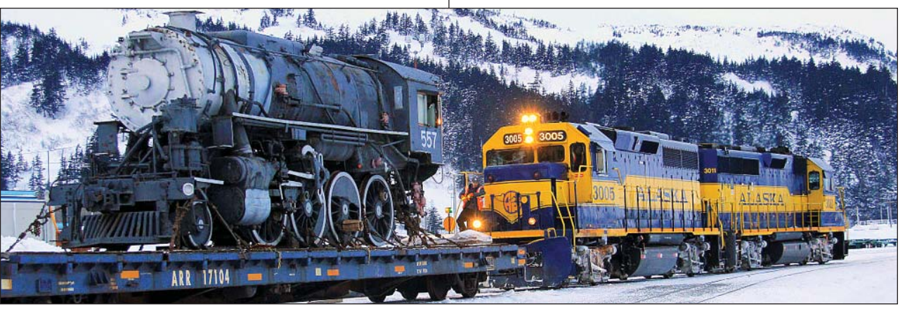
Modern SD70MAC locomotives haul the 557 to Anchorage shortly after arrival by barge in Whittier.