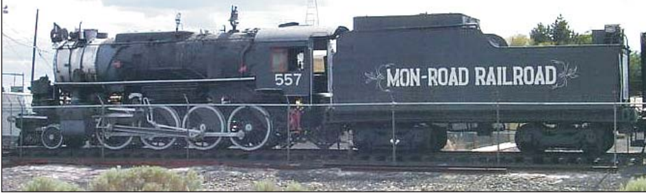
Pictured in 2001, Engine 557 retired at Poverty Museum.

Washington scrap dealer and museum owner Monte Holm purchased No. 557 in 1964. On June 14, 1965, the locomotive left Alaska from Whittier, where it was loaded onto the Train Ship Alaska bound for Everett, WA.