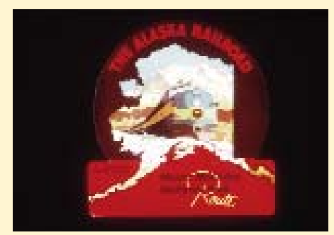
OLD "STEAMER" TRUNK LOGO CIRCA 1950'S