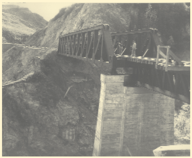
BRIDGE AT MILE POST 355.0 SINCE REPLACED WITH CULVERT IN 1991