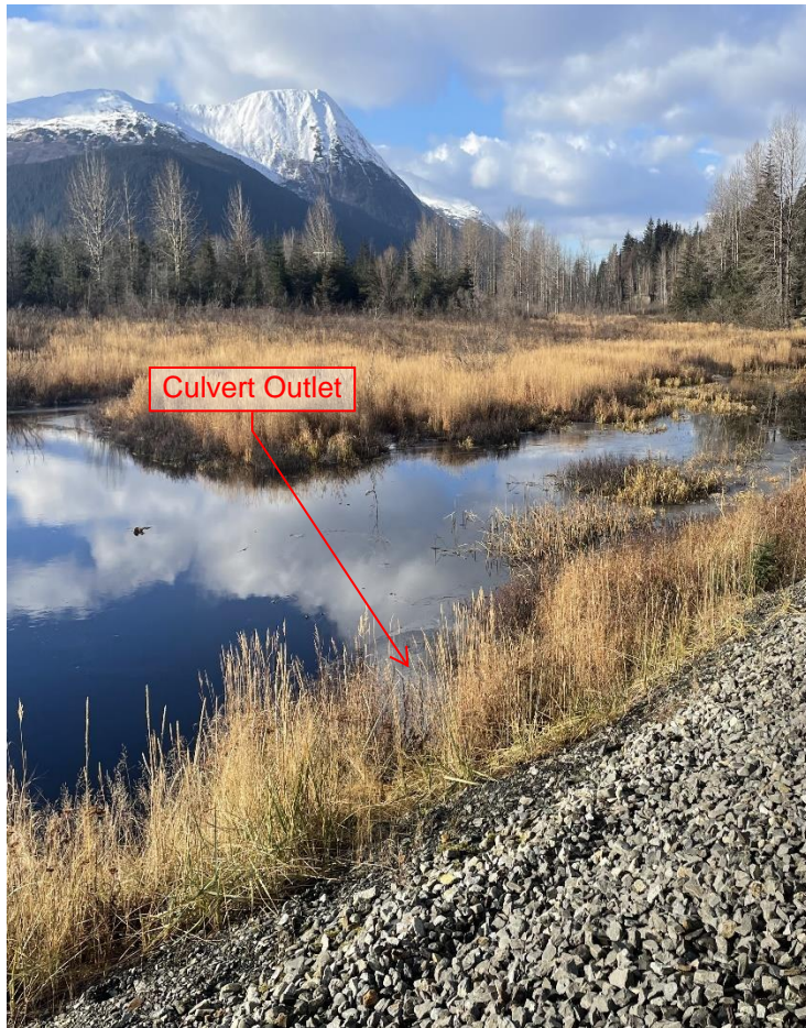
Photo 1. MP 66.09 culvert outlet area (submerged), location shown in red. Looking northwest.