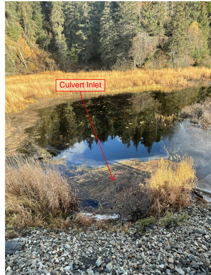
Photo 2. MP 66.09 culvert inlet area (submerged), location shown in red. Looking east.