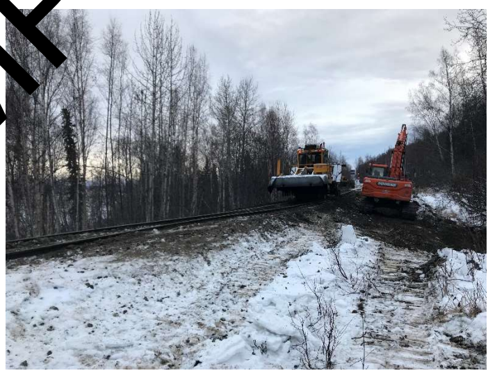
Photo 4: The BR20 and the DX180LC working at the ≈MP 138.5 worksite, looking RR North.