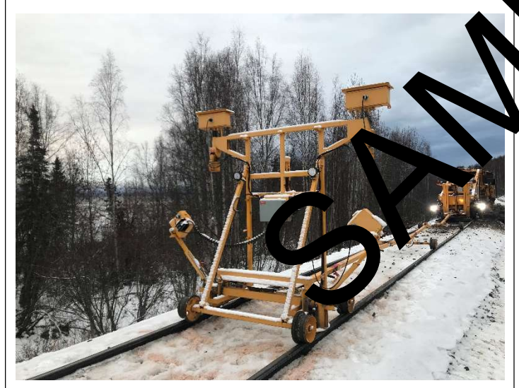
Photo 3: The ET20 realigning and raising the rail at ≈MP138.5, looking RR North-Northwest.