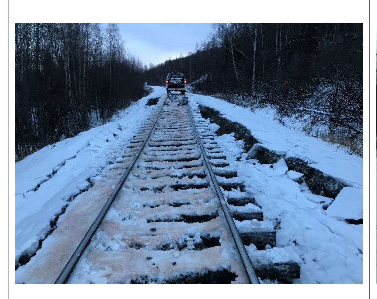
Photo 1: Ice melt placed above the mainline at ≈MP 138.5, looking RR North.