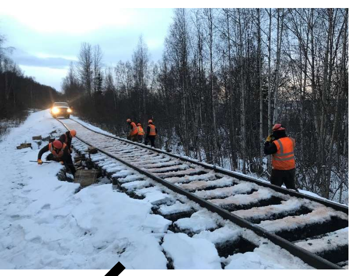
orces jacking and shimming the Photo 2: ARR affected section 138.5, looking RR South-Southwest.