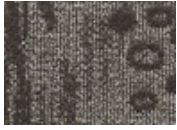
885 Nature's Palette