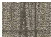
866 Tender Shoots