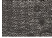
978 Timeless Renewal