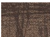
853 Authentic Undertones