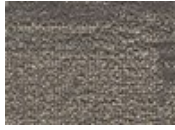
958 Happy Trails