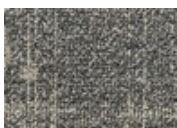
845 Moon River